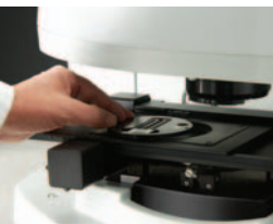
Eject button and Slide-View of OMNIC Picta allow simple and fast sample loading