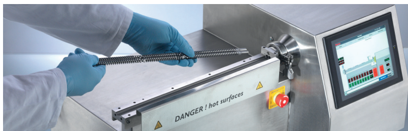
Easy cleaning due to clam shell barrel design with removable top half barrel.

Hot melt extrusion is gaining importance in the pharmaceutical industry. Our 11 mm compounder is also addressing the specific needs in the pharmaceutical industry and is available as a pharma version, too – manufactured according to GMP standards.