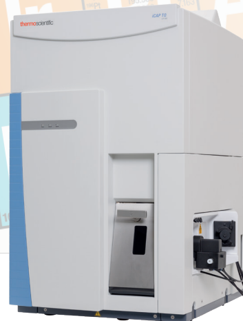
Thermo Scientific iCAP TQ ICP-MS